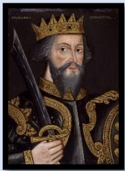
William of Normandy